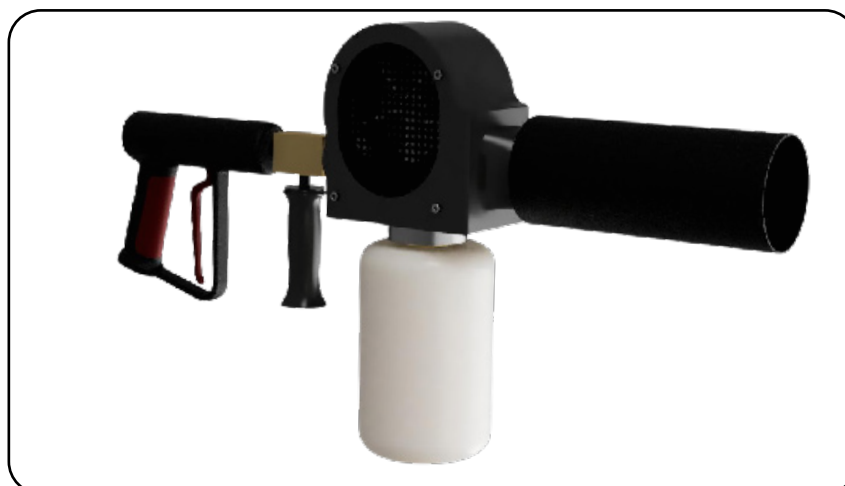
FoamGiant Plus for firefighting systems without integrated foam agent injector